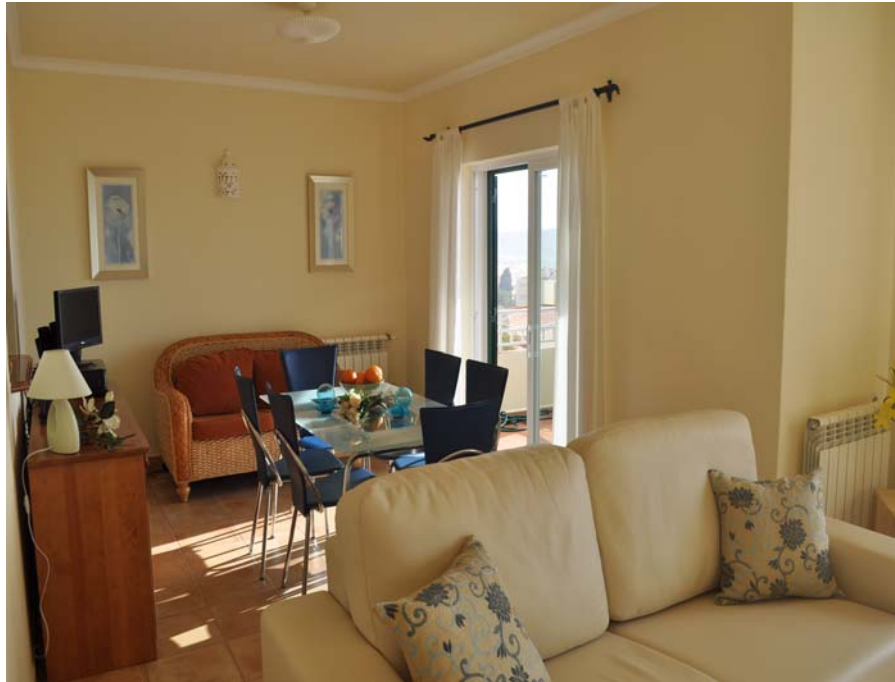
View of lounge and dining area.