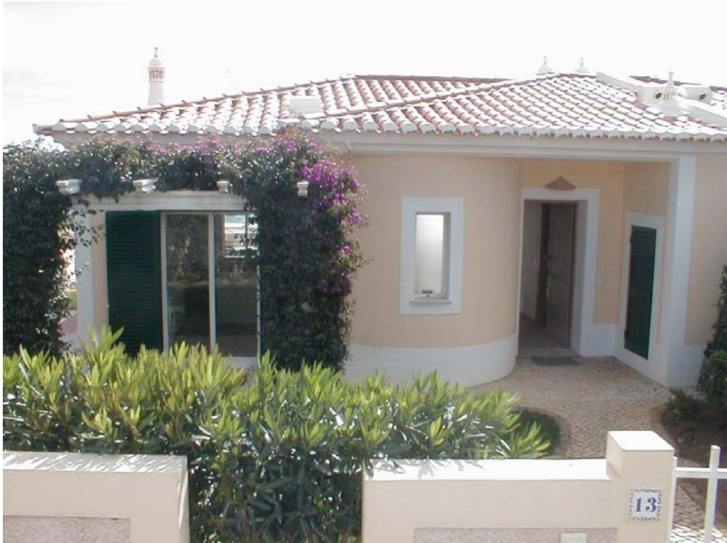
Front of Villa