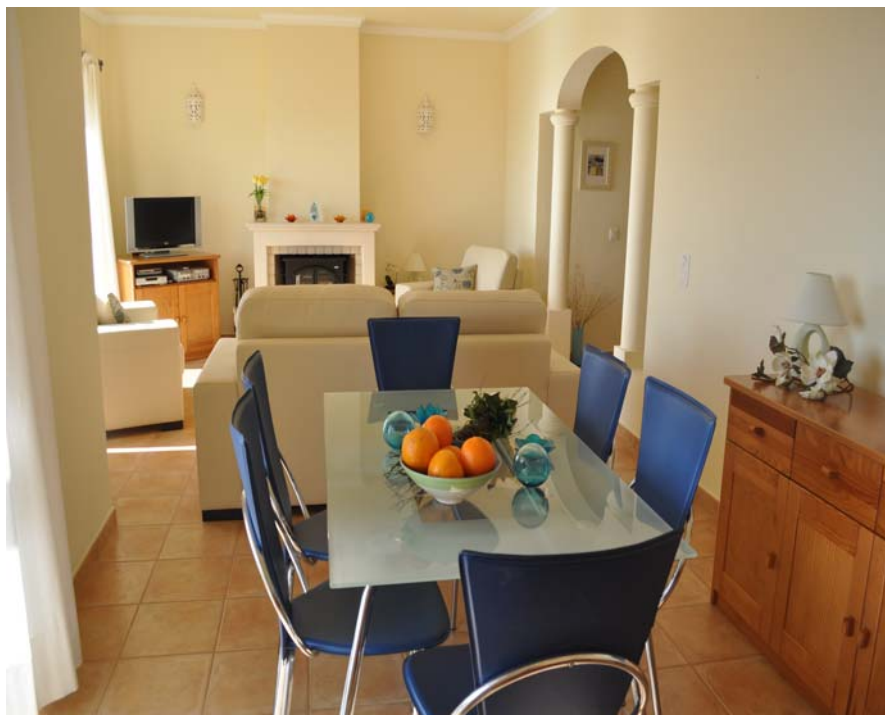
Dining area including WiFi and PC