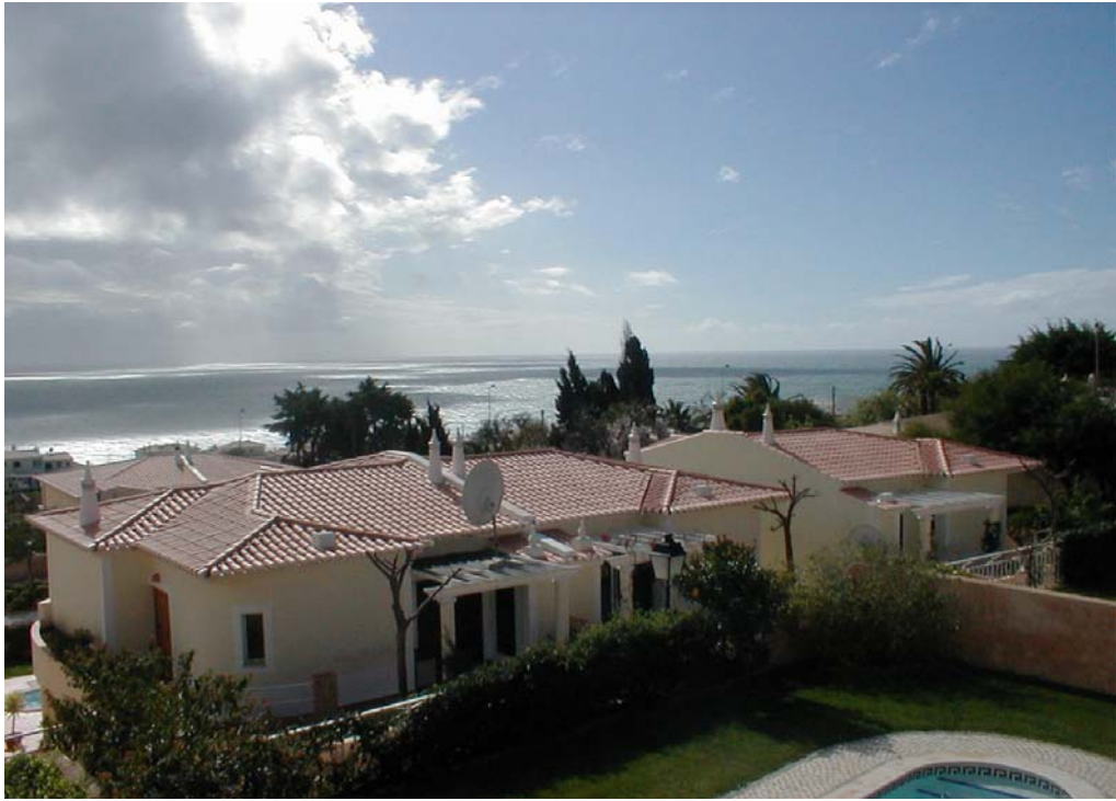
View from terrace.