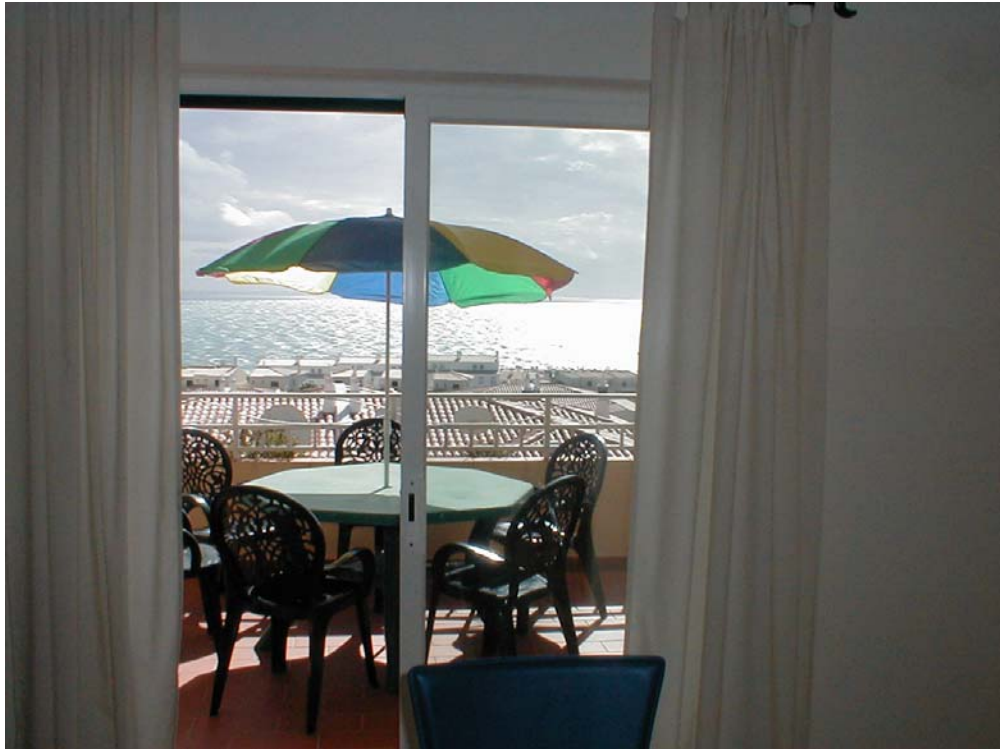
South facing terrace with superb sea views.