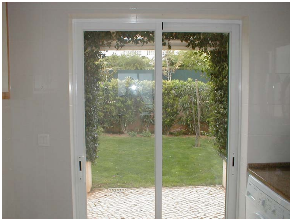
Patio doors from kitchen to front terrace.