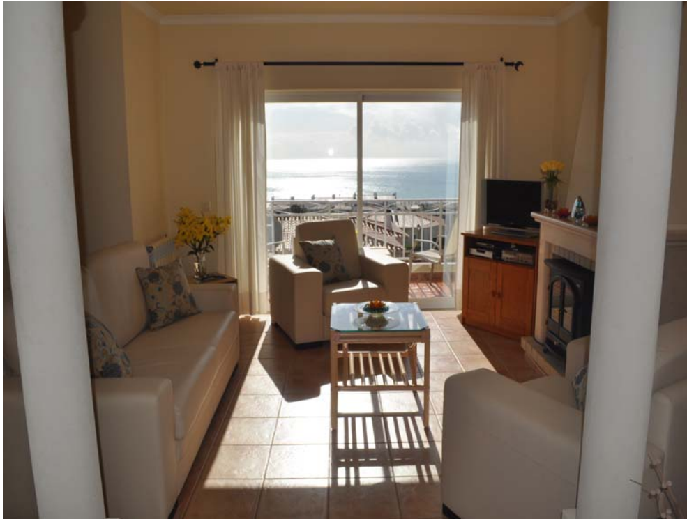
Hallway with W.C. and view to lounge.